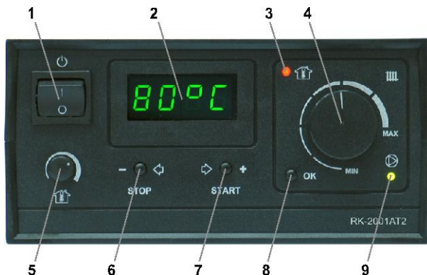
Picture 1. Front of the device.

Basic operation of the device is done by setting desired temperature with boiler thermostat knob, other functions are realized according to parameters programmed in service mode. While changing boiler temperature settings with the knob, the change is displayed on the display for a few seconds (for example [C 75]) and this value means the temperature, which the controller will be trying to achieve. This value can be checked in temperature viewing mode. Depending on heating installation type and service settings, additional thermostat can be used to set desired room temperature, or desired exhaust gas temperature. Additional thermostat knob position change is signaled for several seconds on the display e.g.: [ 20°]. Current value of this setting can also be viewed in temperature viewing mode.